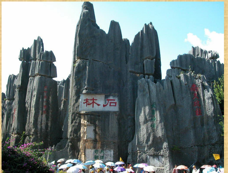
The Dayan Ancient Town, which is reputed as ¡ Venice in the East; was The Stone Forest, south of kunming. It is a world-famous scenic spot included by the UN in 1997 in (The List of the World; s Cultural Heritage).